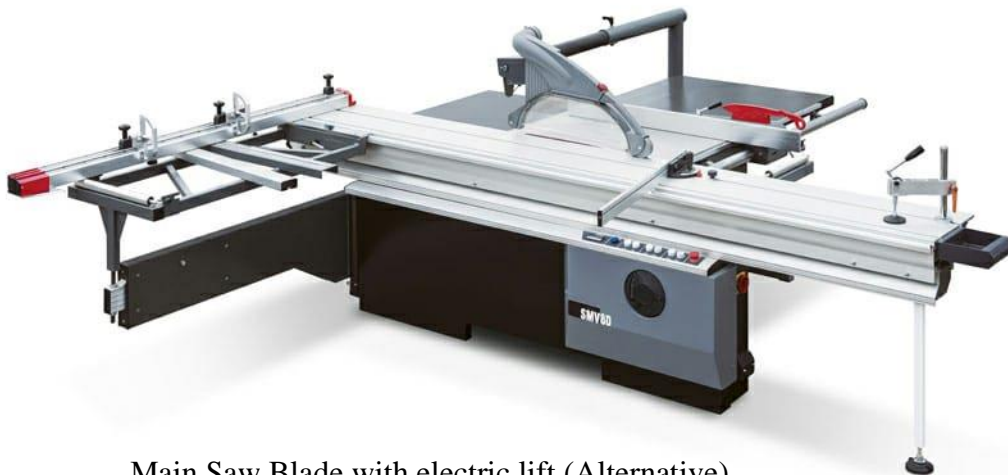
Main Saw Blade with electric lift (Alternative)