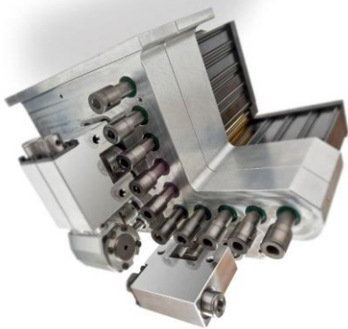
ORIGINAL HSD DRILL HEAD (ITALIAN) 10 VERTICAL DRILLS 6 HORIZONTAL DRILLS 1 SAW IN X AXIS OPTION SAW IN Y AXIS