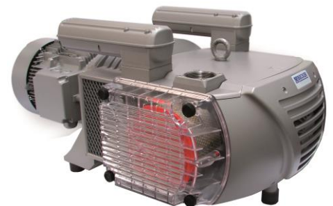
ORIGINAL BECKER PUMP (GERMAN)