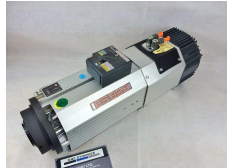
ORIGINAL HSD SPINDLE 9.6KW(ITALIAN)