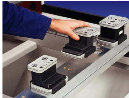
REMOVEABLE SUCTION CUP SYSTEM