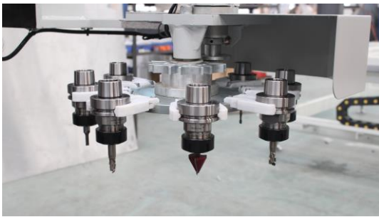
8 POSITION TOOL CHANGER