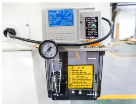
CENTRALISED LUBRICATION SYSTEM